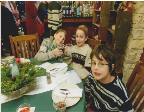
Look like the young folks enjoyed themselves also. ( I hope that's only soda in those drinks)